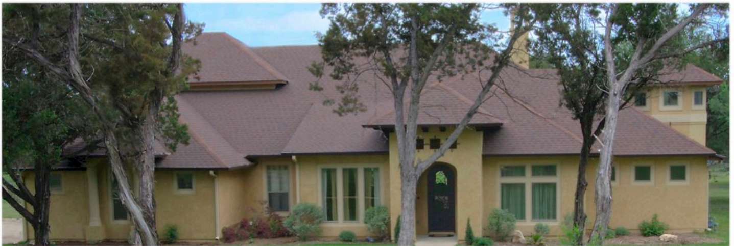
Tuscan Hills II depicted

© COPYRIGHT MMX ADAM MICHAEL HOMES, LLC.